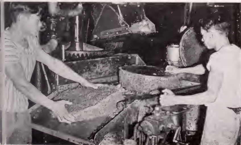
Preparation of palm oil fibre cake

Major fields open to American investors are exploitation of mineral resources, manufacture of light consumer goods, and planting of tropical agricultural products. Mineral reserves include nickel, bauxite, manganese, wolframite, copper, zinc, lead and sulphur. Specialties like tropical forest products and pearl cultivation offer unusual profits.