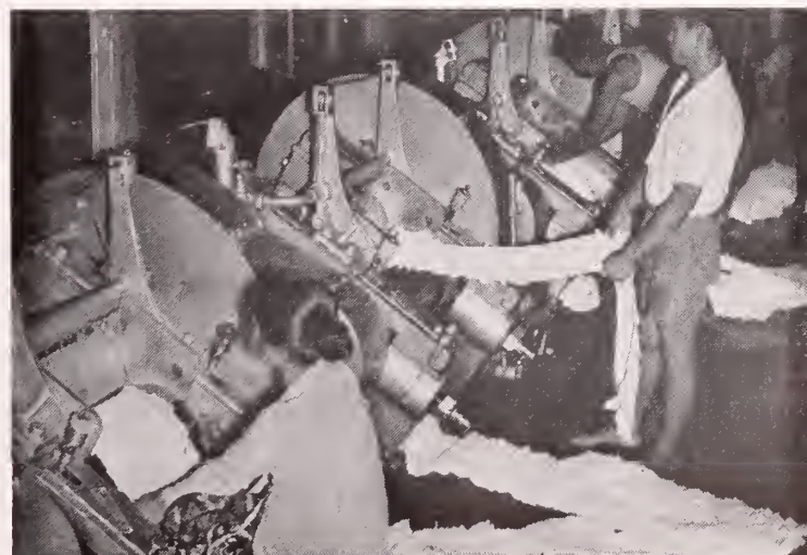
Machine processing of crepe rubber