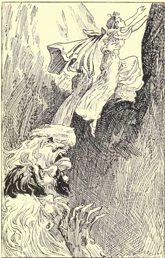
“ WITH ONE SPRING HADVÖR WAS OUTSIDE THE GRAVE ”