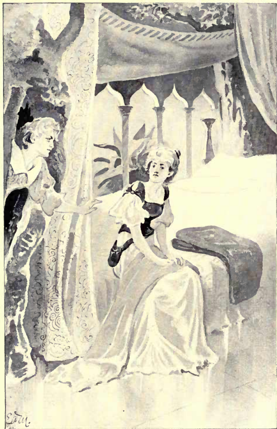
"CREEPING FORTH FROM HER TREE, GREATLY TO LAUFY'S SURPRISE." Page 109.