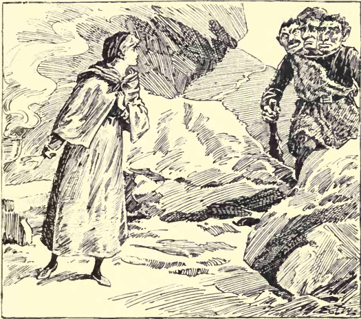
“SHE SAW A BIG THREE-HEADED GIANT.”

was very hungry, for she had had nothing for her breakfast but some hard, dry crusts, and a glass of cold water. Neither would she now help herself to any of the fire without asking leave from the owner of the cave.