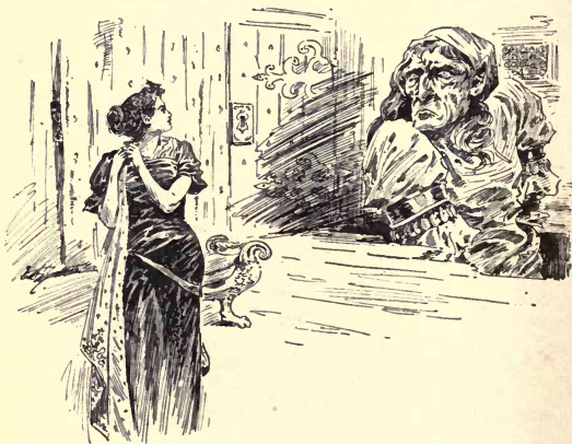
"A GIGANTIC WOMAN APPEARED."

"Aha!" cried the giantess, her wicked, malicious laugh making the rafters ring. "Then if he be so far