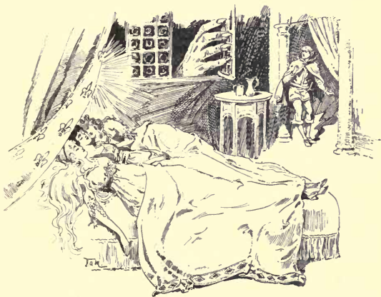
“A MONSTROUS HAND OPENED THE LATTICE.”

On, on, on, they went, till at last they came to the foot of a high mountain. Steep and precipitous before them the sides rose up—no foothold to be seen anywhere. Climbwell, however, never hesitated. He showed his brothers a strong silken cord that he