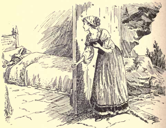
“SIGNY ENTERED VERY SOFTLY.”

As they came in, the taller and elder of the two