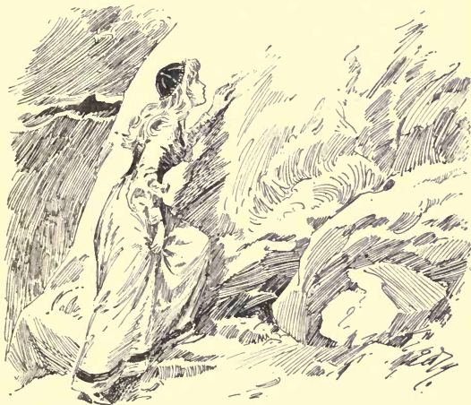
“OLGA WENT BRAVELY UP THE ROCK.”

mouth at the wild, weird scene, walked courageously forward, turning neither to the right nor left till she reached the rock on which sat the bird, his crest raised fiercely, while angry flashes of light from his eyes almost blinded her. No sooner, however, had