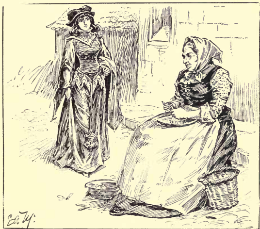
“THE OLD COOK WAS SITTING ON A STOOL SHELLING PEAS.”

“You ought to be ashamed of yourself to be so helpless,” answered the cook, crossly, for she had no love for the new queen and her daughter. “It is all very well for a poor old woman like me not to be