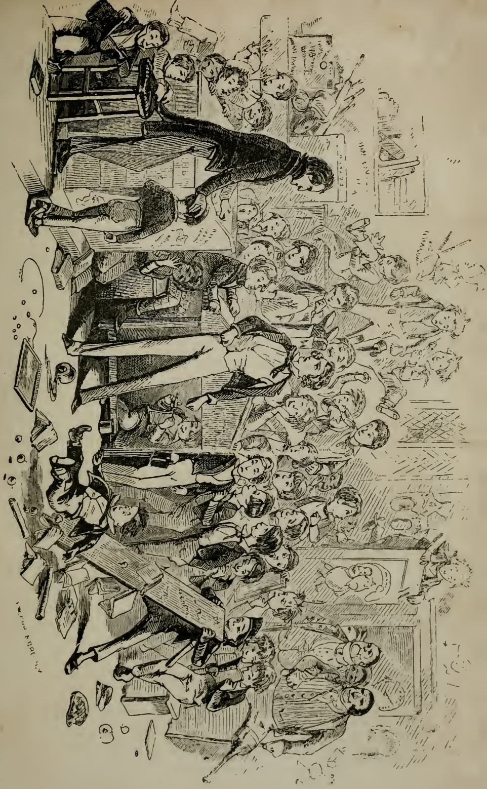
Steerforth and Mr. Mell.