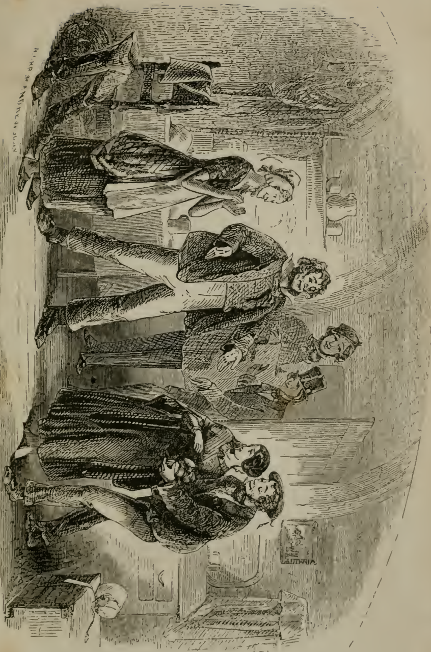
We were unexpectedly at Mr. Peggoty's Fireside.