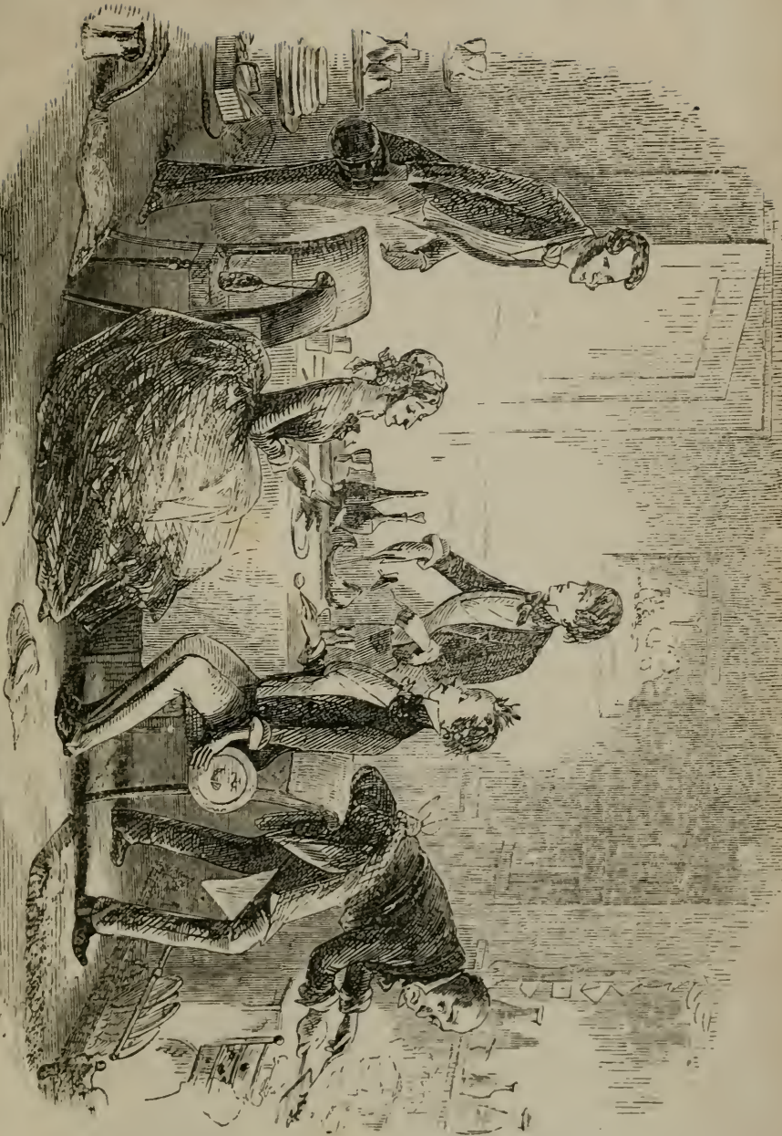
We are disturbed in our Cookery.