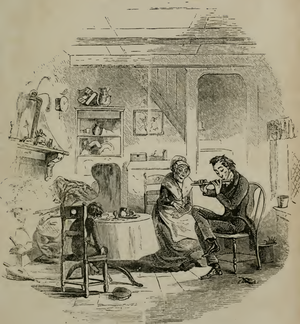
My musical Breakfast