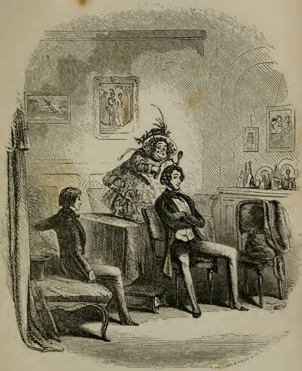
I make the Acquaintance of Miss Mowcher.