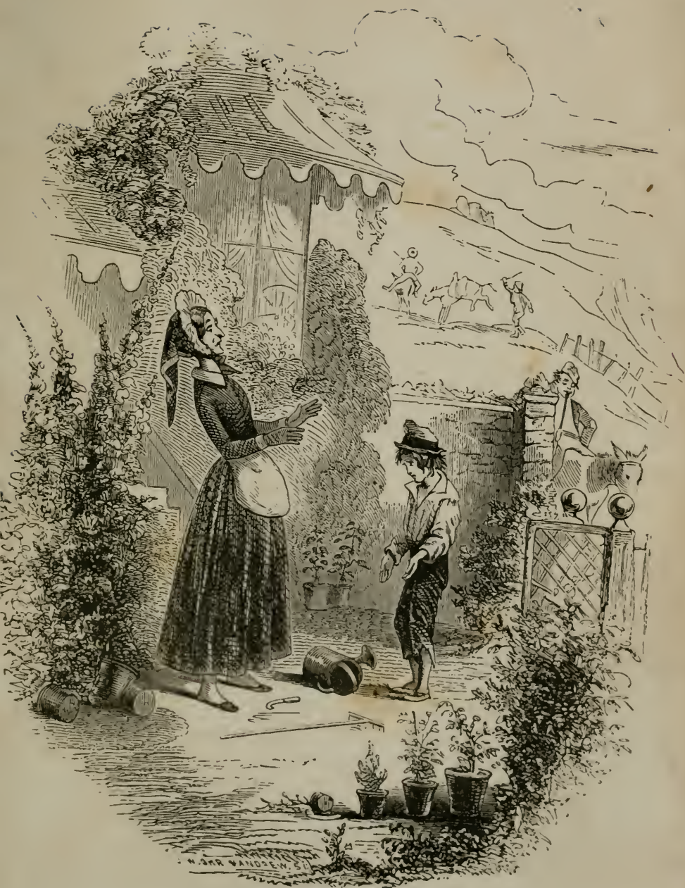
I make Myself known to my Aunt.