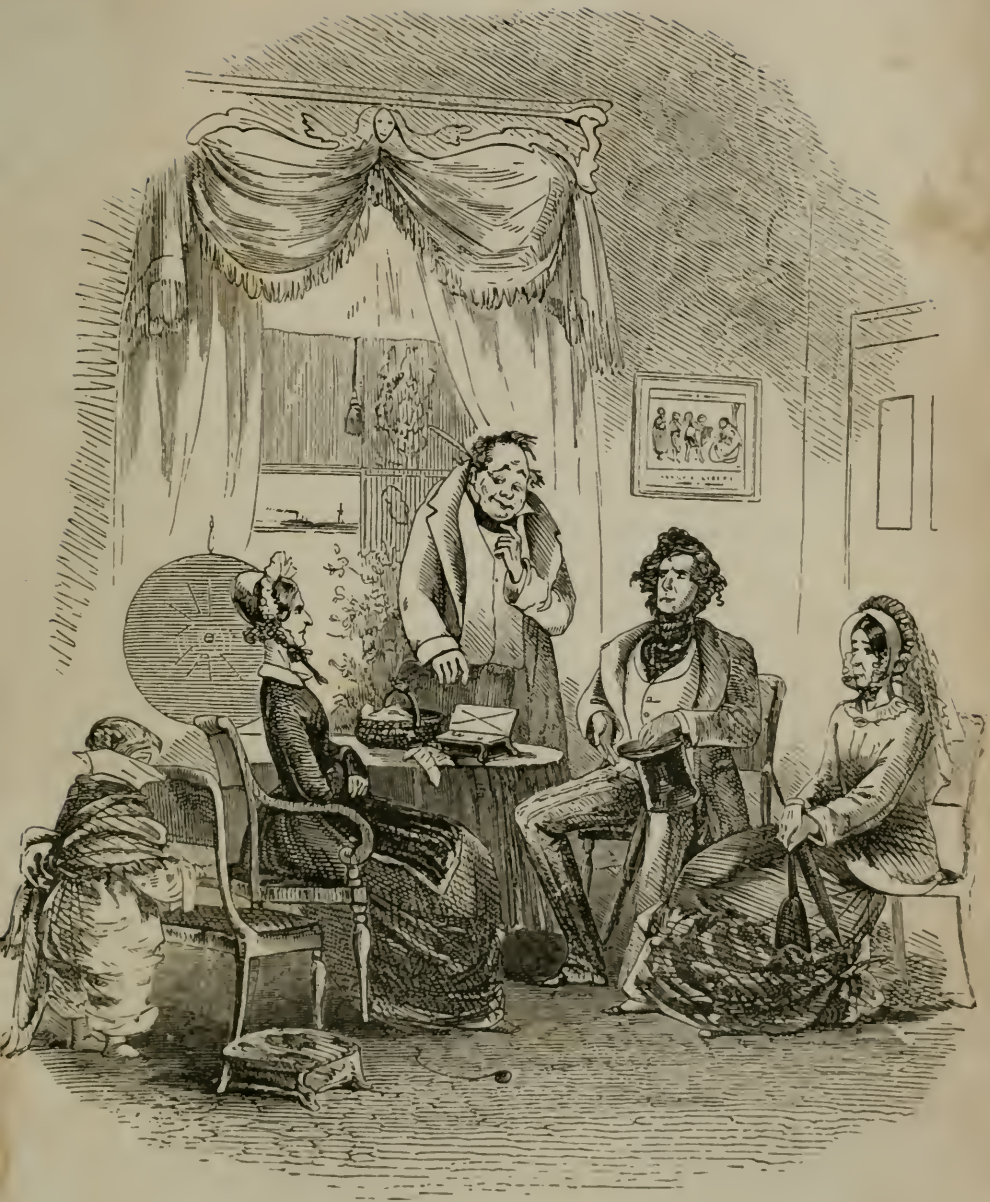
The Momentous Interview.