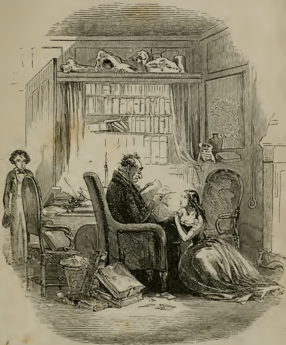
I return to the Doctor's after the Party.