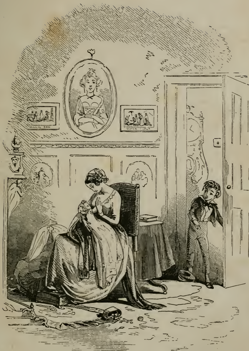
Changes at Home.