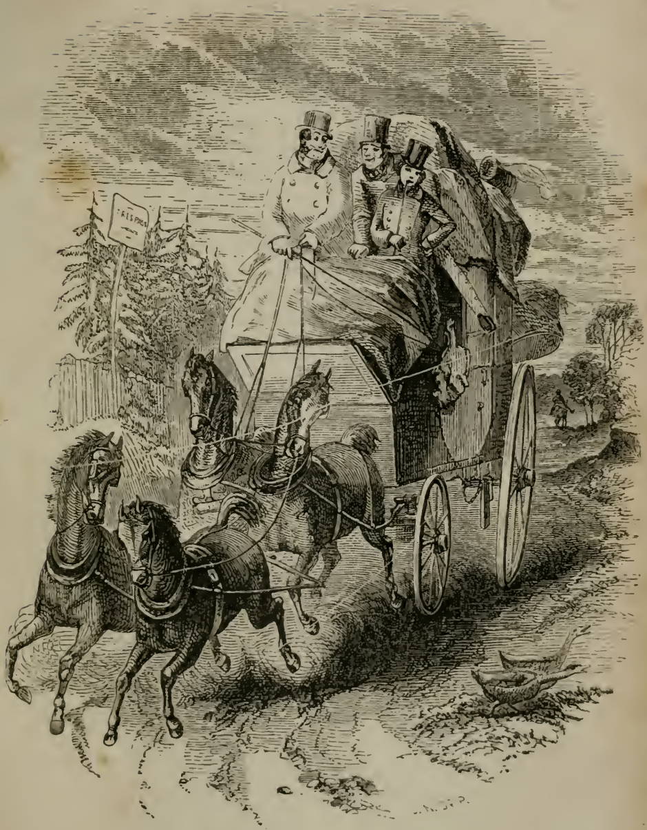
My first Fall in Life.