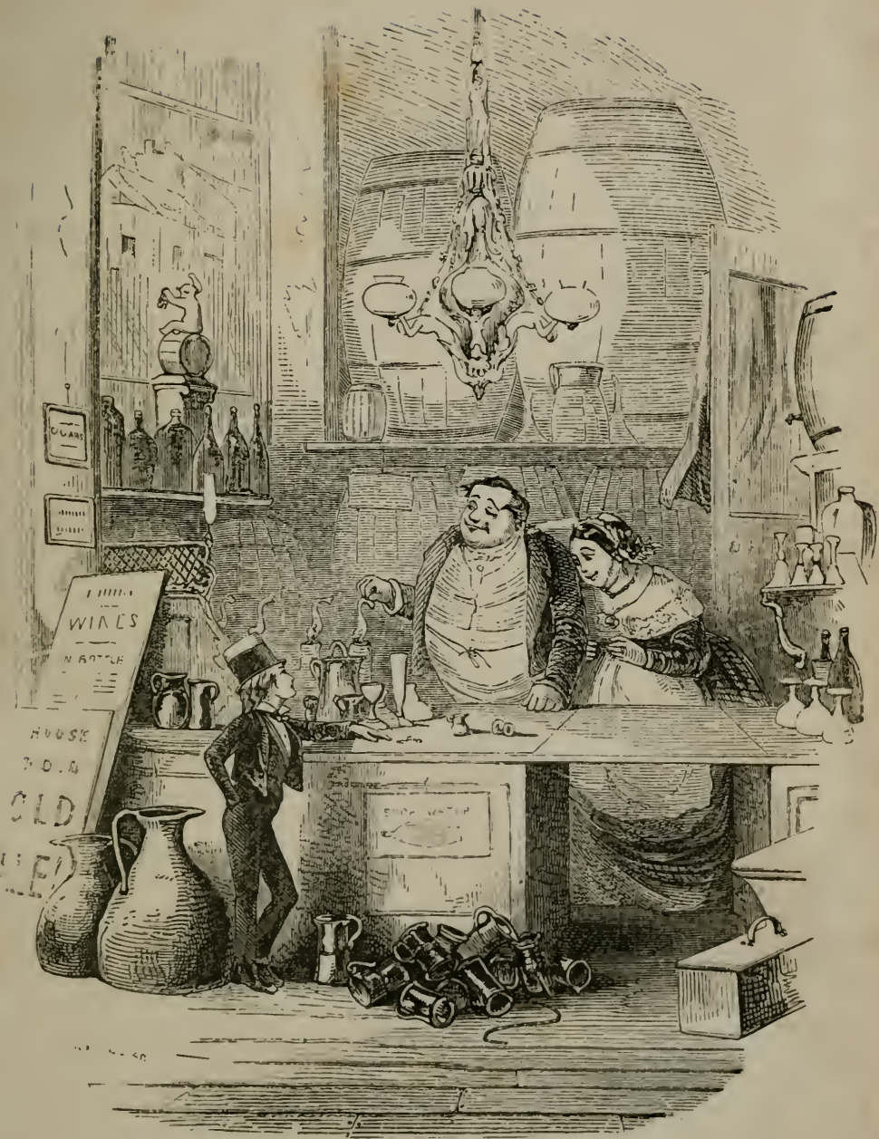
My magnificent Order at the Public House.