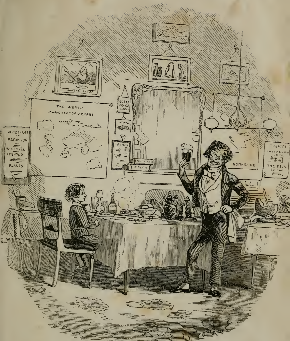
My friendly Waiter and I.