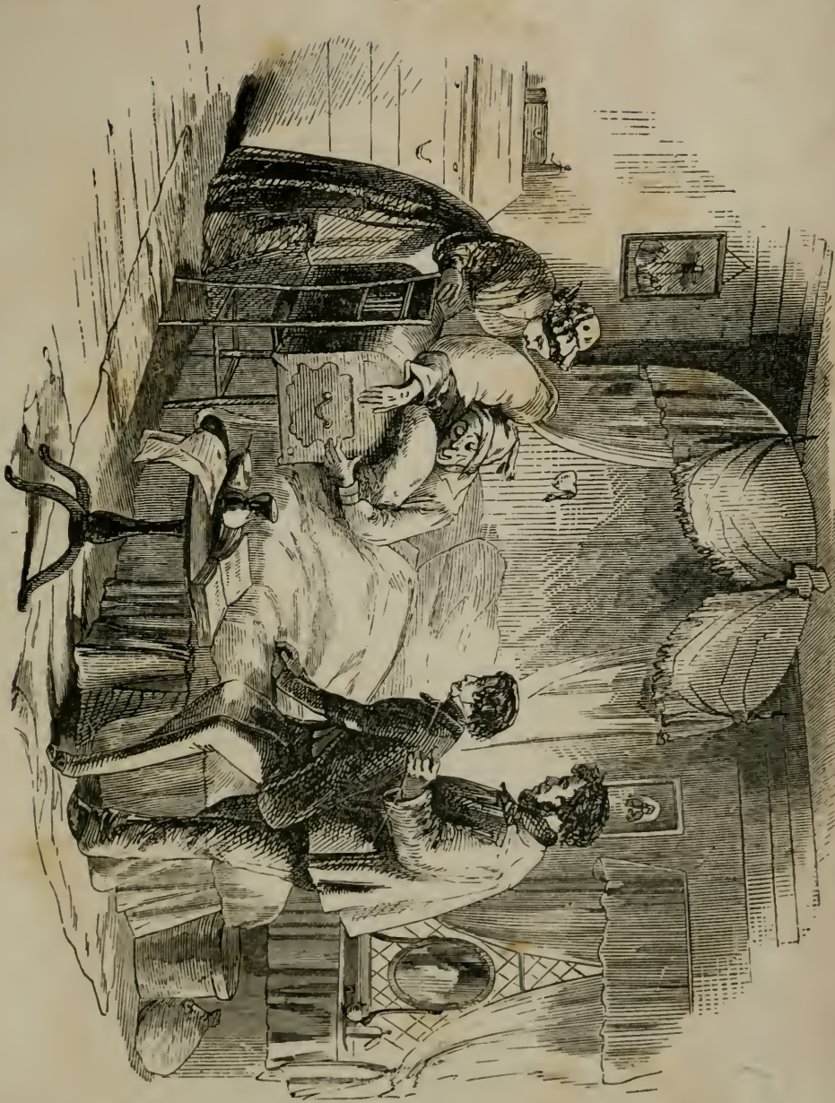
I find Mr. Barkis 'going out with the Tide.'