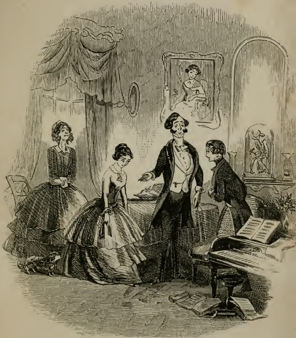
I fall into Captivity.