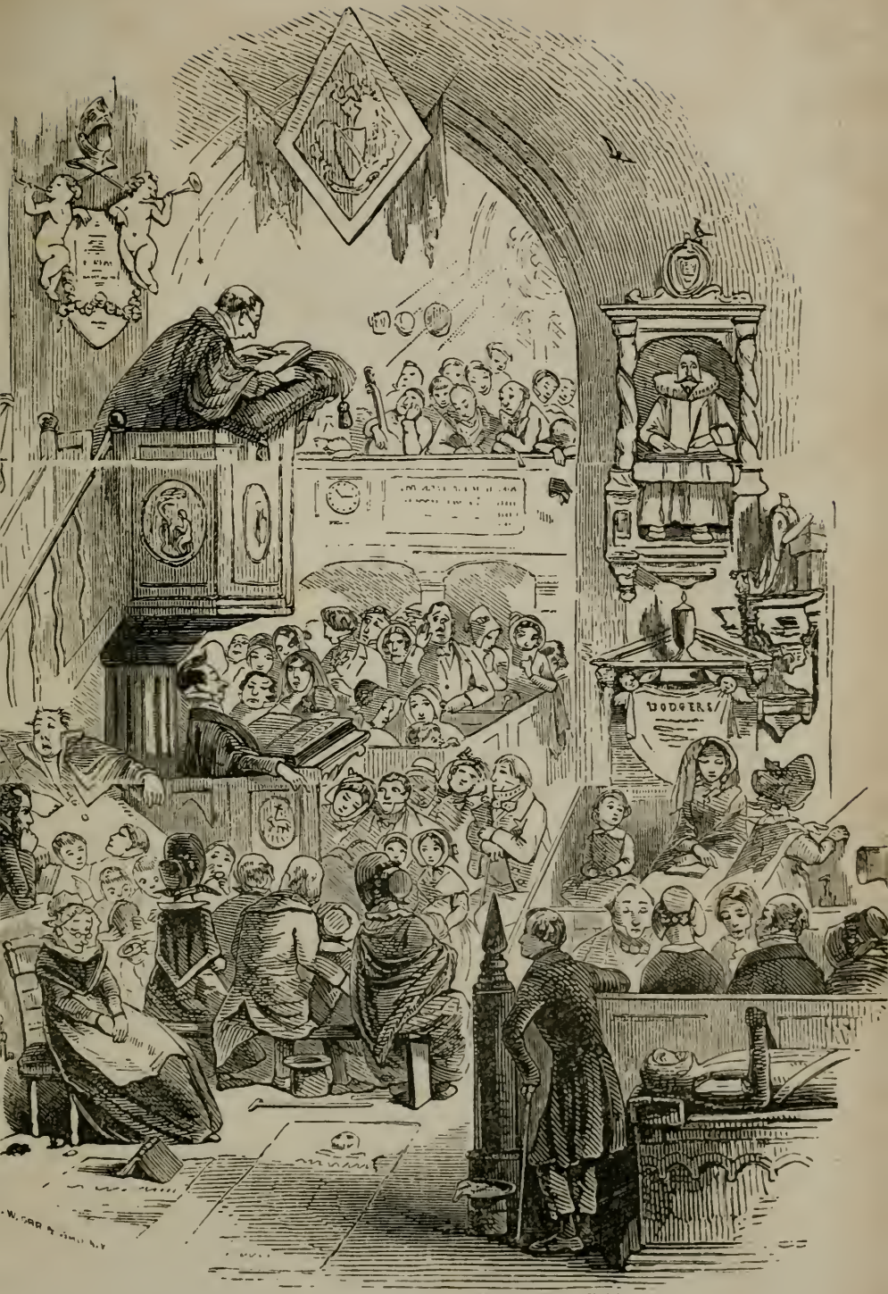
Our Pew at Church.