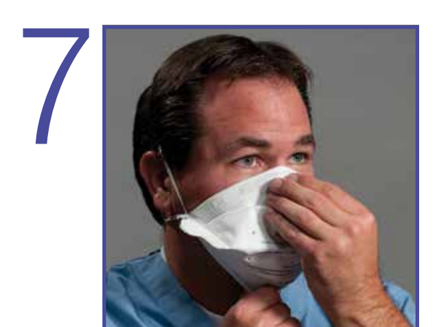
Adjust by pulling bottom edge under chin while holding top edge on nose.

Make certain hair, facial hair, jewelry and clothing are not between your face and the respirator as they will interfere with fit. Make certain respirator is completely opened and edges lay flat against your face.