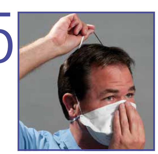
Pull second strap over your head and position it high on the back of your head.