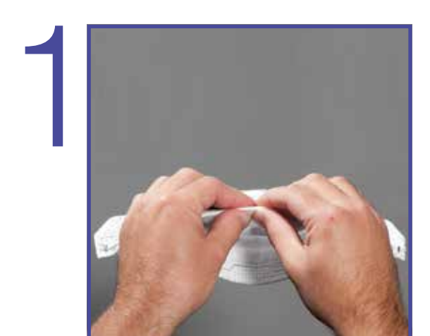
Place fingers from both hands on top side of nosepiece. Place both thumbs underneath side of nosepiece and bend slightly at center of nosepiece.