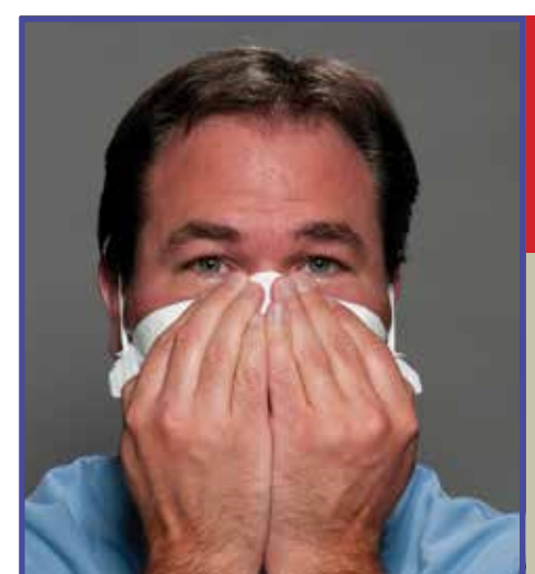
Perform a User Seal Check

Check the seal of your respirator each time you use the respirator.