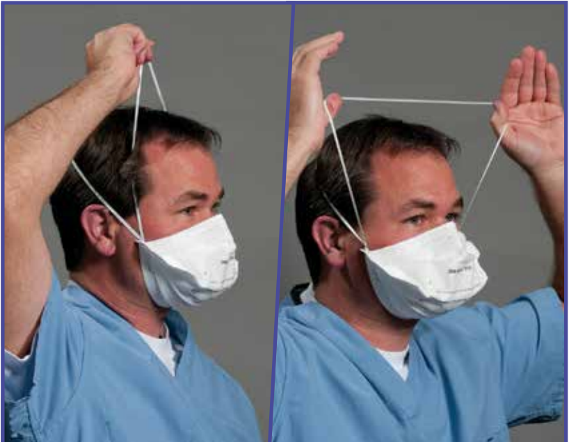
Without touching the respirator facepiece, slowly lift the bottom strap from around your neck up and over your head.