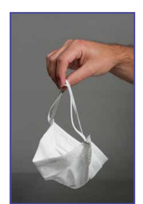
Store or discard according to your facility's infection control policy.