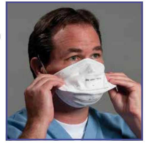
Tabs on side of respirator may be used to further adjust facepiece for comfort.

Make certain hair, facial hair, jewelry and clothing are not between your face and the respirator as they will interfere with fit. Make certain respirator is completely opened and edges lay flat against your face.